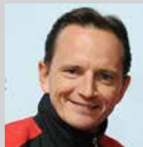
Jean Micheal Saive

Secretary General, European Olympic Committees